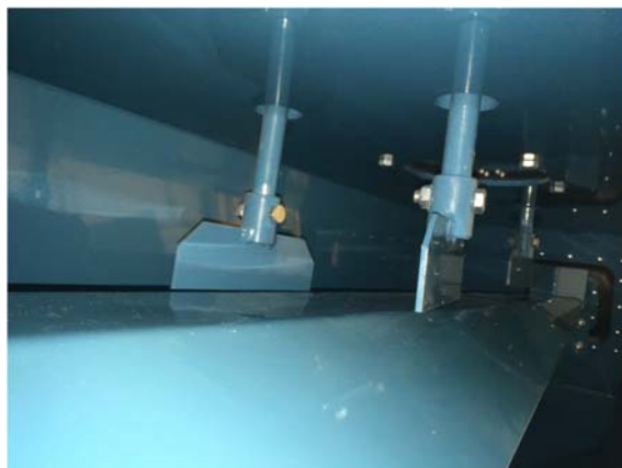
(Interior adjustable vibrating distribution)